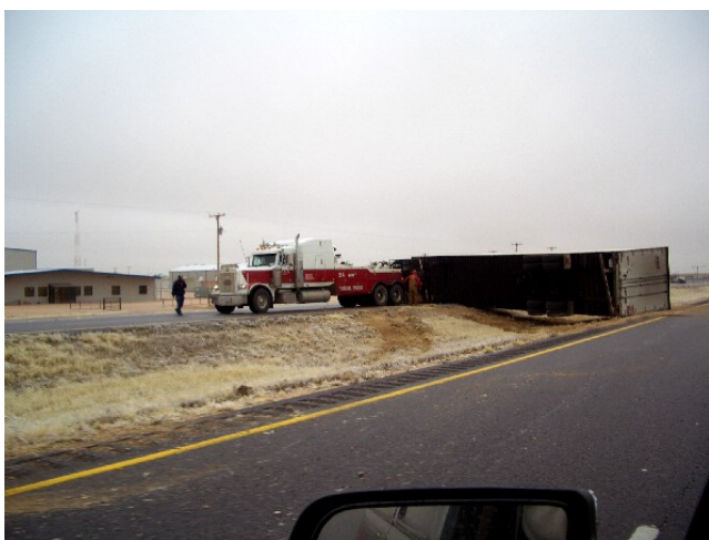
This is just one of the more than 20 overturned tractor trailers that Tim & Sherry saw on the way back from California

As one approaches within 4-5 miles of town, you see clutches of 5-15 RVs dry camping in the desert. As you get closer to town, from about a mile out, there are RVs as far as the eye can see on both sides of the highway.