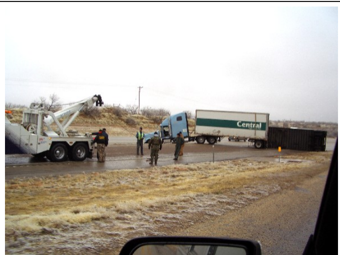
Another part of a big rig on its side.